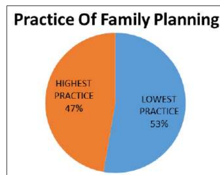
Fig 2: Practice of family planning among nursing mothers

although some of the nursing mother have discussed family planning and ideal family size with their husband and most of the husband agreed to use family planning methods in LUTH, Lagos